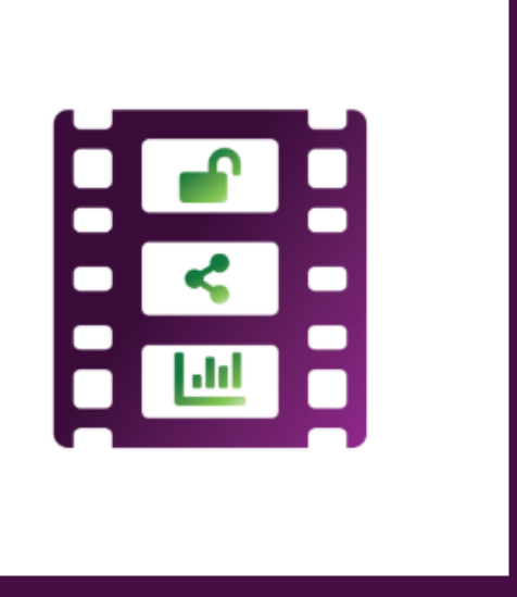
How to access, share and analyse recordings