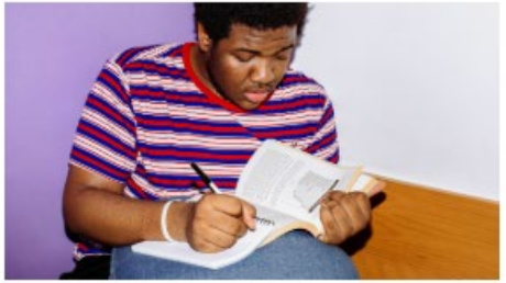
Space and Student Accommodation

Lead: Sarah Duckering More details to be added when available