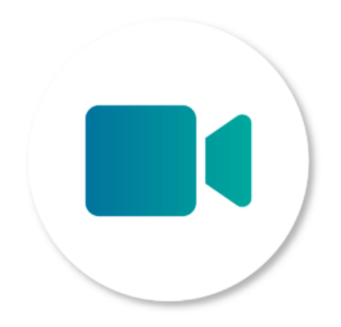
Watch and Listen