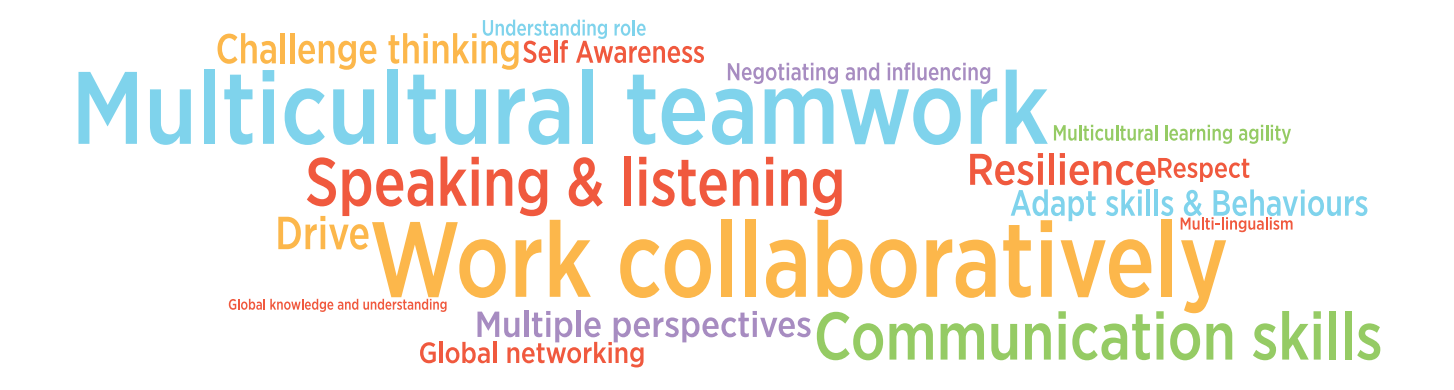
Figure 2. Graduate employers' ratings of global competencies (from CIHE, 2015)

In many discussions of the internationalisation, it is the development of the skills and capabilities associated with intercultural competence that is the most highly prized learning goal, yet at the same time the most challenging one to fulfil. Intercultural competence has been defined as students' capacities 'to work with their own and others' languages and cultures, to recognise knowledge in its cultural context, to examine the intercultural dimension of knowledge applications, and to communicate and interact effectively across languages and cultures'<sup>22</sup>.