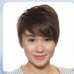
Dr Lucia Fung School of Business, HKBU